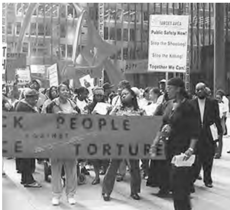
Left, a BPAPT action; right, fliers by community groups